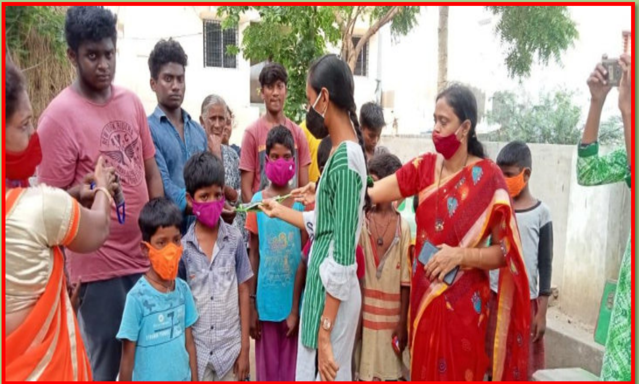
Distribution of masks to the orphanage