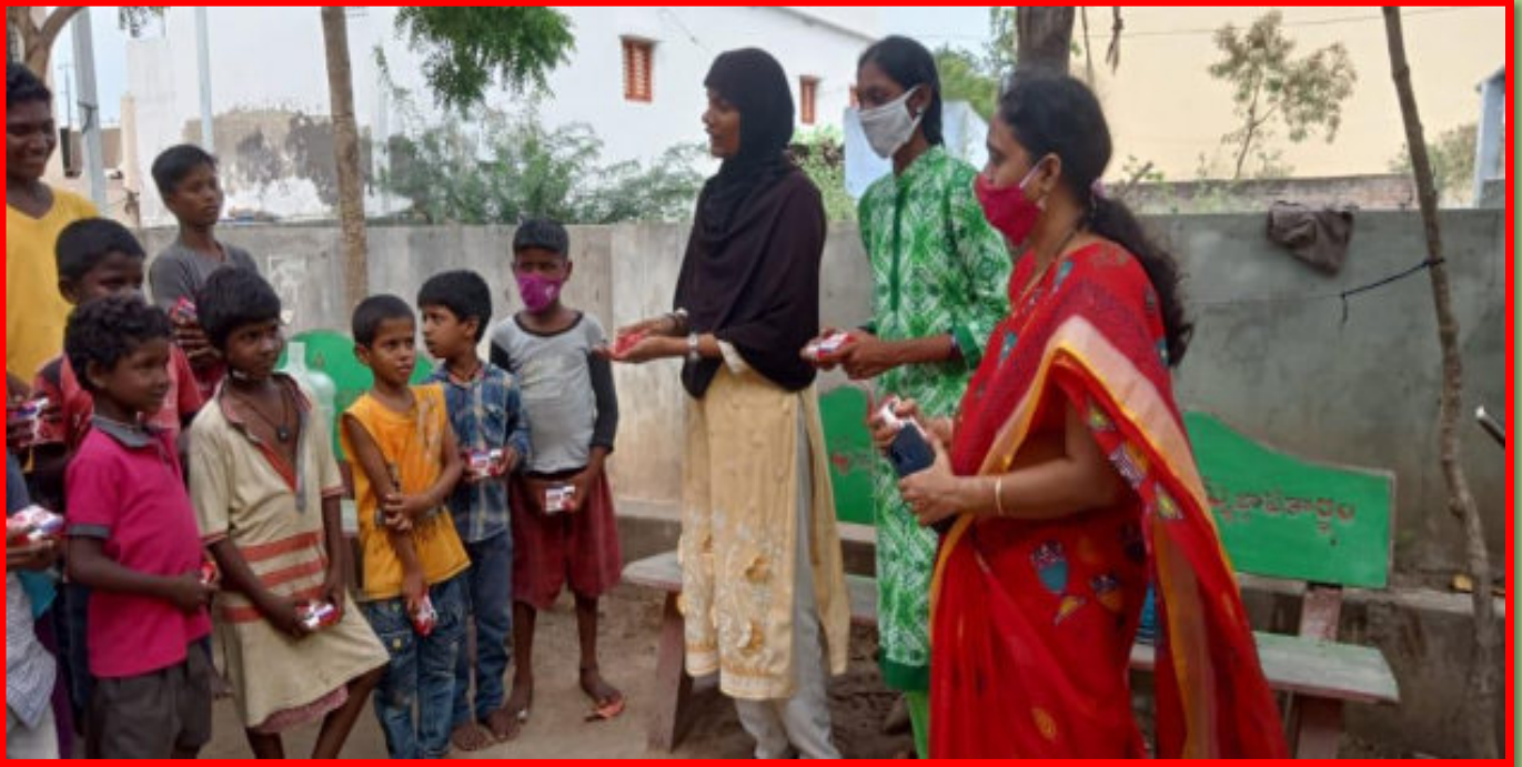
Awareness on washing hands