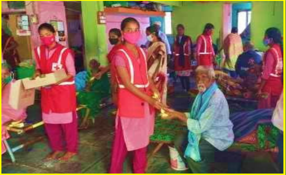
Service programmes in Old age homes and Orphanages